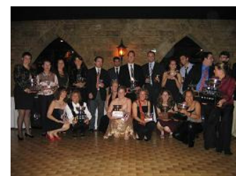
2006 Year End celebrations.

Saturday, September 29 at The Granite Club